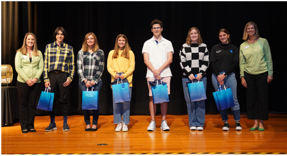
CHELCO's six scholarship winners were drawn at the 2022 Annual Meeting.

After two years of virtual annual meetings, CHELCO returned the event to its in-person format on April 9 at Freeport High School. Hundreds of CHELCO members joined us for a day of family fun, entertainment, prize and scholarship giveaways and updates on our co-op.